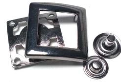
E 1777 ( 8.3 gr) 27 x 27 mm Snap button - clothing and bag snap button