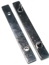
B 143 ( 3.9 gr) 2 Pieces Snap button 29 x 6 mm