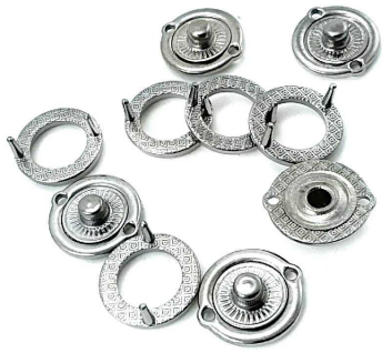
E 2161 ( 3 gr) Ring Shaped 15 mm Snap Button