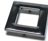
E 1221 ( 18.5 gr) Eyelet double piece snap button 30 x 30 mm E 1221