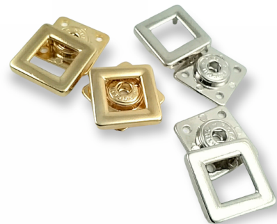
E 1282 ( 12.5 gr) 25 x 25 mm Aesthetic Square Coat and Jacket Snap Button