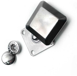
E 2036 ( 11.5 gr) 25 x 25 mm Outwaer Snap Fastener Button