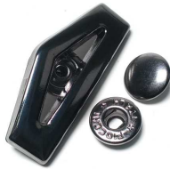
E 1832 ( 3.5 gr) 44x18 mm Outerwear snap button