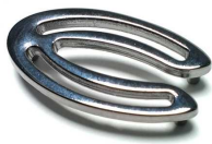
E 1840 ( 6 gr)

Oval double piece snap button 30 x 17 mm