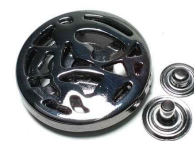
E 1330 ( 14.5 gr) Round zamak studs button diameter 22 mm