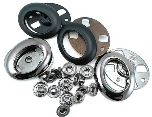
B 161 ( 15 gr) 40 x 30 mm Double piece oval snap button