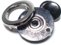
E 669 ( 6.15 gr) 15 mm diameter Eyelet snap button