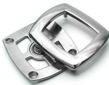
E 2014 ( 3.5 gr) 30 x 25 mm Snap Button Square Frame Figure