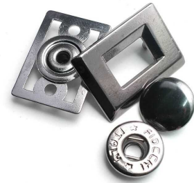
E 2013 ( 7.5 gr) 17 x 24 mm Decorative Fastening Button