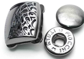
E 1978 ( 6 gr)

Snap button - garment and bag snap 73 x 73 mm