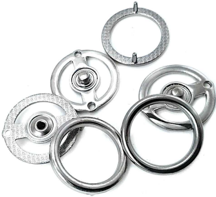
E 2159 ( 8.08 gr) 27 mm Snap Button - Ring Shape