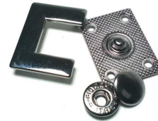
E 1772 ( 10.5 gr) 30 x 23 mm Snap Button - Decorative and Stylish