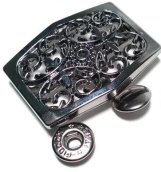
E 1564 ( 19 gr) Stylish patterned metal snap button 45 x 32 mm