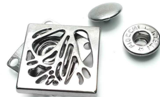
E 1931 ( 9.5 gr) Snap Fastening - Decorative 4 piece set 25x25 mm