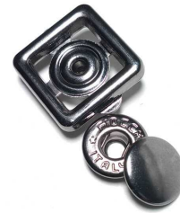
E 1965 ( 7.5 gr) 20 x 20 mm Square snap button accessory E 1965 | Snap Fastener Prices