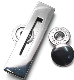
E 1594 ( 12 gr) 45 x 10 mm Stylish Snap Button