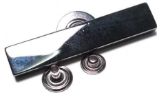
E 1873 ( 4.5 gr) 60 x 12 mm double piece snap button