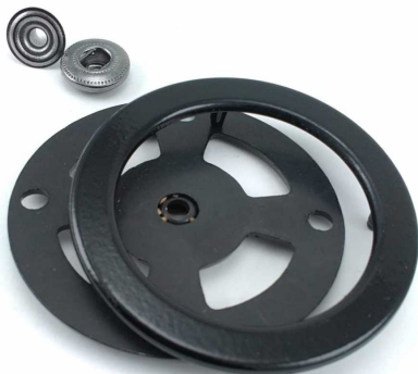
E 912 ( 29 gr) Eyelet snap button button diameter 50 mm