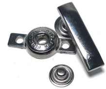
E 1733 ( 7 gr) Rod shape double track snap button 30 x 7 mm