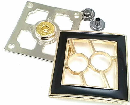
E 1310 ( 31 gr) 42 x 42 mm Patterned and stylish metal snap button