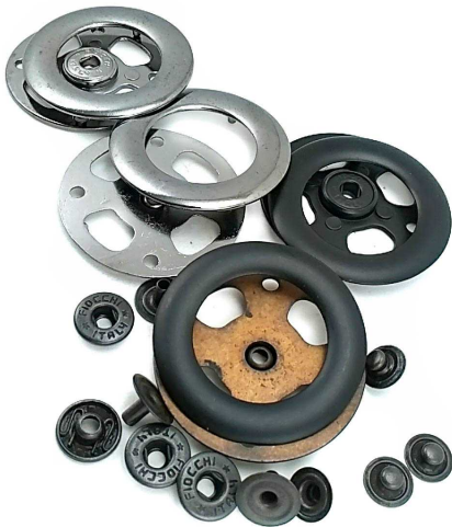
E 969 ( 21 gr) Eyelet double piece snap button button diameter 45 mm E 969