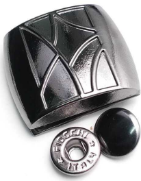
E 1794 ( 15 gr) Double-track trim snap button 30 mm