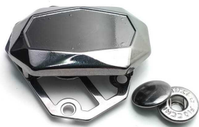
E 1793 ( 6 gr) 45 x 30 mm Snap Button - Decorative and Stylish