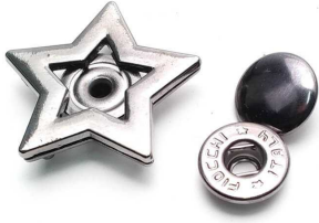
E 1984 ( 9.5 gr) Star double-piece 40 mm snaps çift 1984