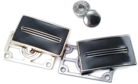
E 2113 ( 11 gr) Stylish Snap Button Enameled 35 x 21 mm