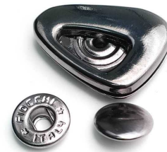
E 1925 ( 7.5 gr) Double track oval snap button 28 mm