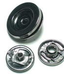
E 1829 ( 6 gr) Eyelet snap button button diameter 17 mm