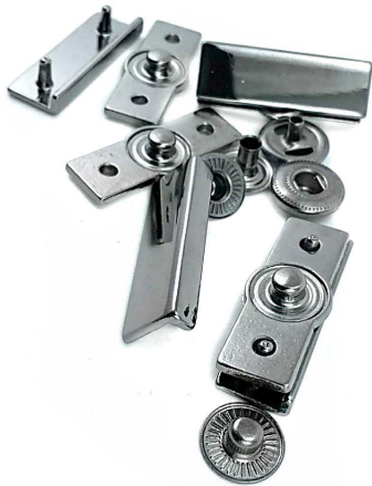
E 2162 ( 8 gr) 30 x 10 mm Rod Shape Snap Button