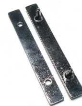
B 136 ( 7.8 gr) 50 x 6 mm Zinc Rod Shape Zamak Bag Accessory