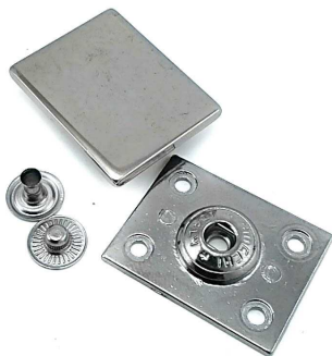
E 1701 ( 17 gr) Double track snap button 32 x 25 mm