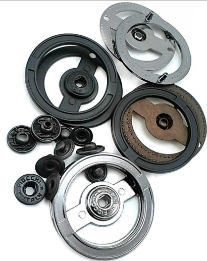
E 1311 ( 18 gr) Circle 43 mm double snaps