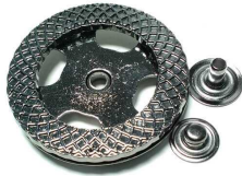
B 103 ( 19 gr) Round and patterned metal studs button diameter 38 mm