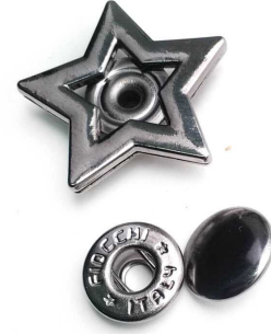
E 1985 ( 5.6 gr) Star shape snap button double track 25 mm şekil 1985