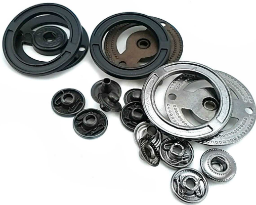
B 113 ( 15 gr) 33 mm Decorative and Stylish Circle Snap Fastening