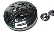
E 1298 ( 22 gr) Round metal double track studs button diameter 44 mm metal