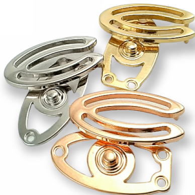
E 1839 ( 10.5 gr) 40 x 22 mm Metal Snap Button