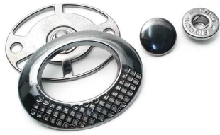
E 1972 ( 11 gr) 40 x 30 mm Snap Button Oval Shape Coat Jacket and Outerwear Snap