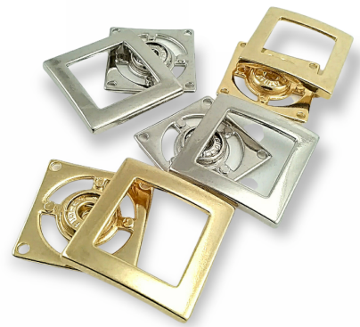
E 1831 ( 16.5 gr) 32 x 32 mm Metal Snap Button Square Shape E 1831