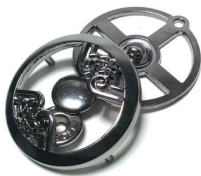
E 1543 ( 14 gr) Round Metal Snap Button Button Diameter 37mm metal