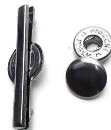
B 191 ( 5.5 gr) Double-section round strut rim 23 mm E 1182