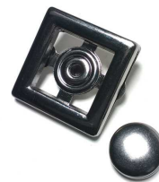
E 1881 ( 9.5 gr) Eyelet Two-piece square snap button 24 x 24 mm