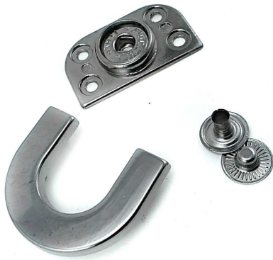
E 1761 ( 14 gr) 32 x 28 mm Decorative Snap Fastener Button C Shape Zinc Alloy S1761