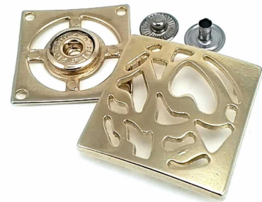
E 1760 ( 17 gr) 34 x 34 mm Snap Button Decorative Patterned Overcoat Snap Button